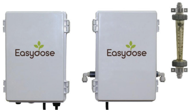
Outdoor rated enclosures and analog flow meter